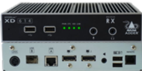
ADDERLink XD614 RX - Front & Rear

CAT6 is recommended for CATx extensions. CATx extensions are limited to 2 patch connections. Patch cables should be CAT6 or better.