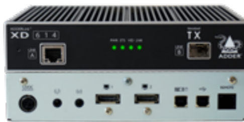
ADDERLink XD614 TX - Front & Rear